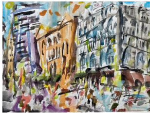
Glenarm & 16 th -West of Surrender Saloon & Kitchen, wall to the right of entrance "We have a wall waiting to hang your watercolor." - Leah, co-owner