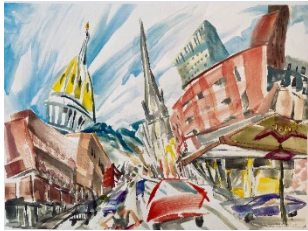
Pearl & Colfax-Entrance, Tom's Starlight "I never knew Tom's Diner has been renovated in 1960's decor to Tom's Starlight!" - Passerby