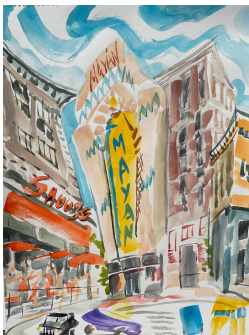
2nd & Broadway-Entrance, Snooze Eatery "You've become an attraction when you paint outside our restaurant." - Kevin, manager