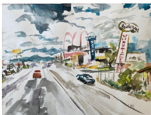
Wabash & Colfax "Before I-70 was built, E Colfax greeted visitors coming from the east into Denver with inviting motels sporting outdoor pools along the Avenue." - Ed Natan